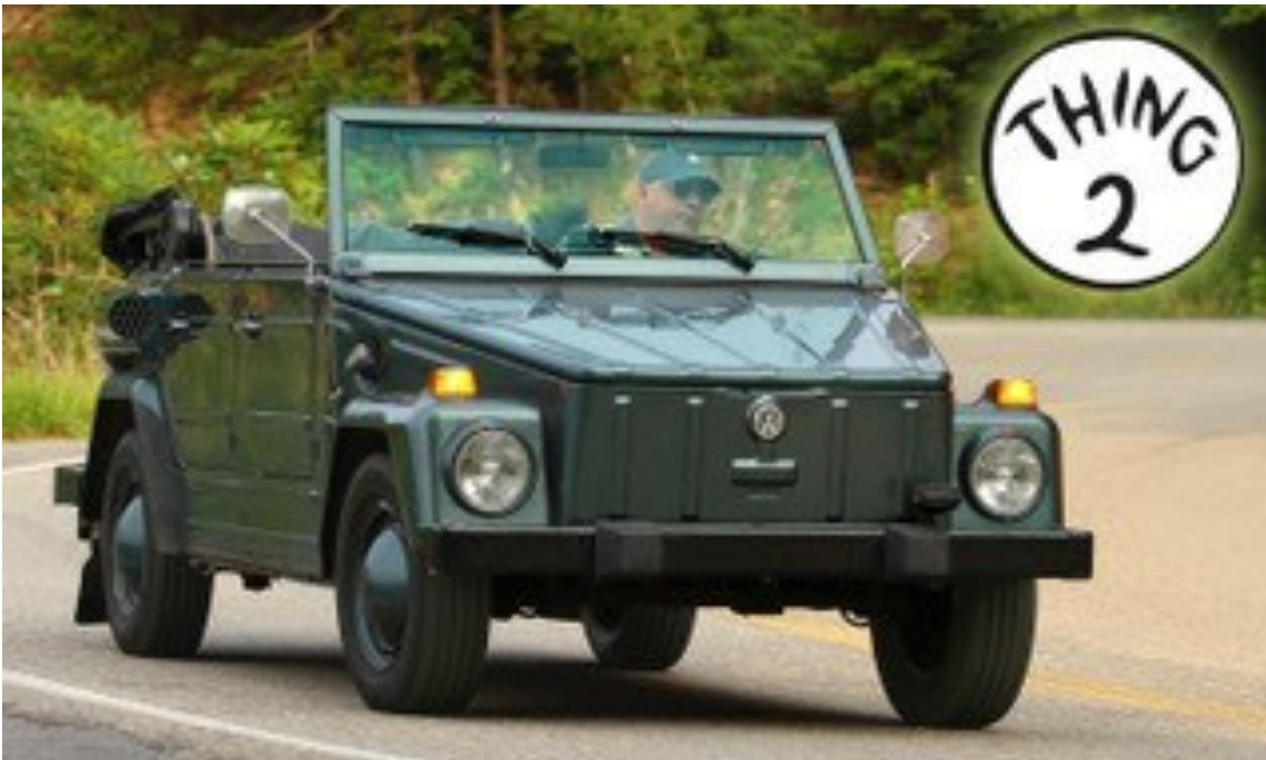
The Well traveled 181 negotiates the curves on US 129... AKA "The Dragon"